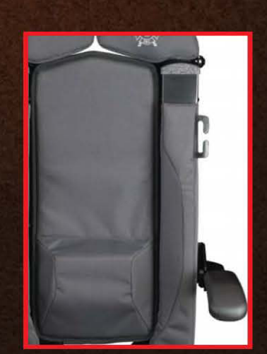
SOFT PARADE PANEL