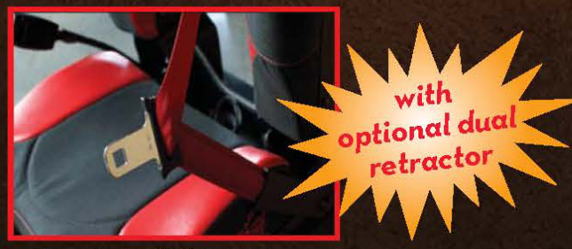
· Promotes Seatbelt Use

Optional materials available upon request.