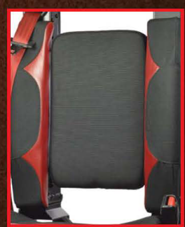
HARD PARADE PANEL