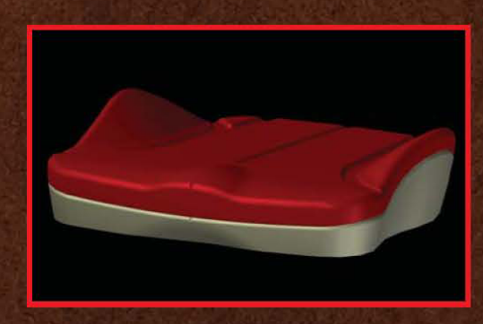
D2 FOAM TECHNOLOGY (DUAL DENSITY FOAM)