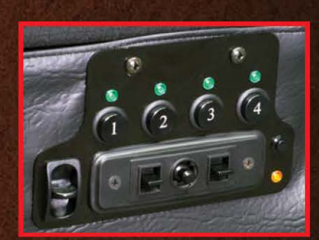
MEMORY SEAT FEATURE Available on Electric HB Driver Seats Remembers Preferred Position for up to Four Drivers